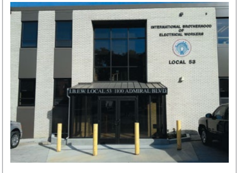
Local 53's newly remodeled union hall.